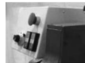
Optional motorised rotation kit for pipe 8 & 12