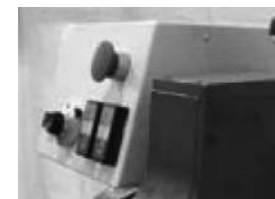
Optional motorised rotation kit for pipe 8 & 12