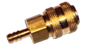
Gas inlet push fitting universal on all sizes.

The double seal system can be purchased individually or in kit form for a range of pipe diameters.