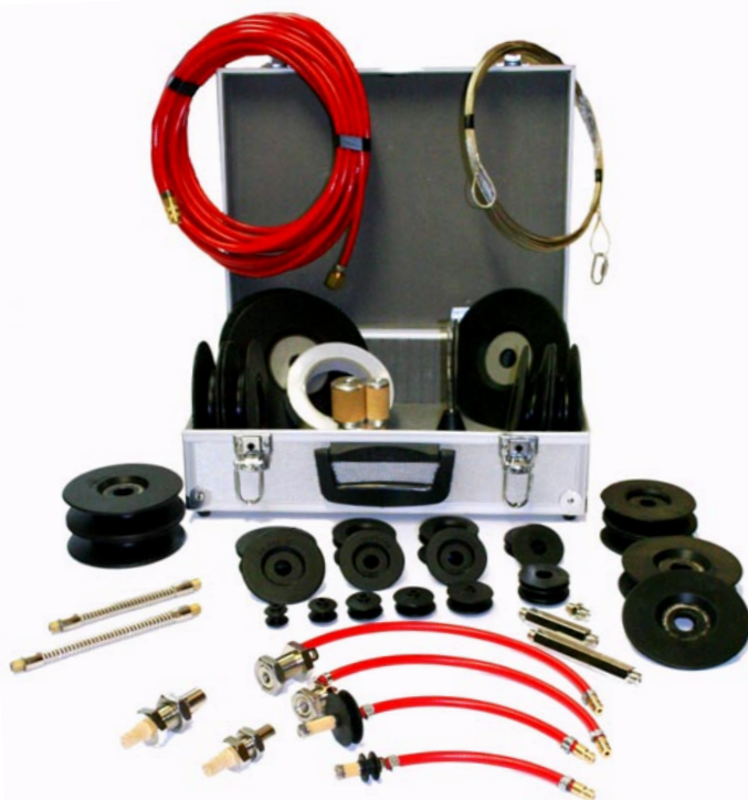
Available as a kit for 16-165mm (DSK16-165)