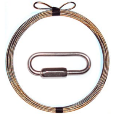
Supplied with a carabiner and insulated withdrawal cable for sizes 38mm upwards for ease of withdrawal from the pipe.