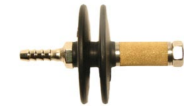
Single Gas Finger for smaller pipe and tubes.